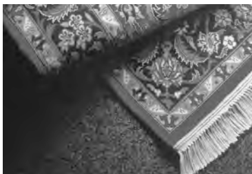
[ area rugs ]

Hypoallergenic when dry. Does not leave residue; rinses completely. Excellent for use on silk or wool carpets. Nontoxic. Biodegradable.