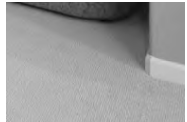
[ carpet edges ]