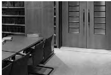
[ under doors ]